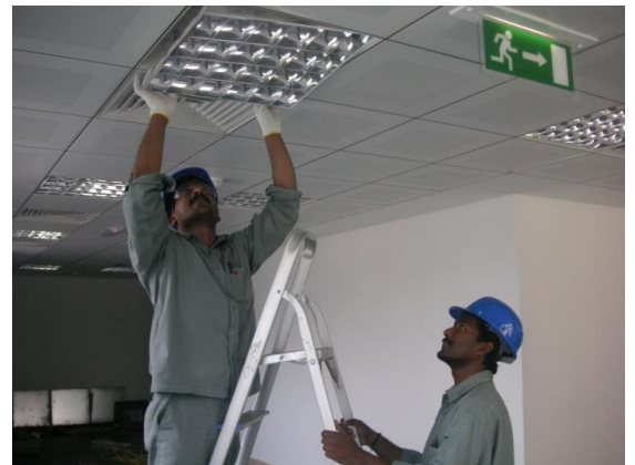
CABLE LAYING WORKS FOR INTERNATIONAL CAP