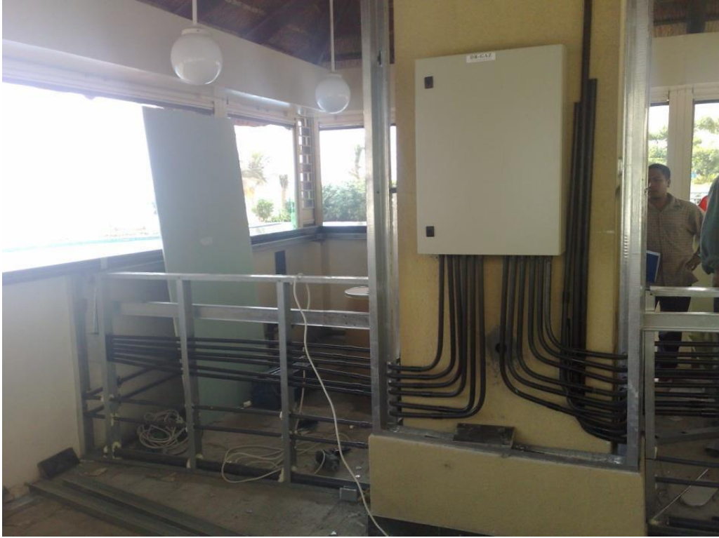
ELECTRICAL WORKS @ IFA CLUBHOUSE-PALM JUMEIRH