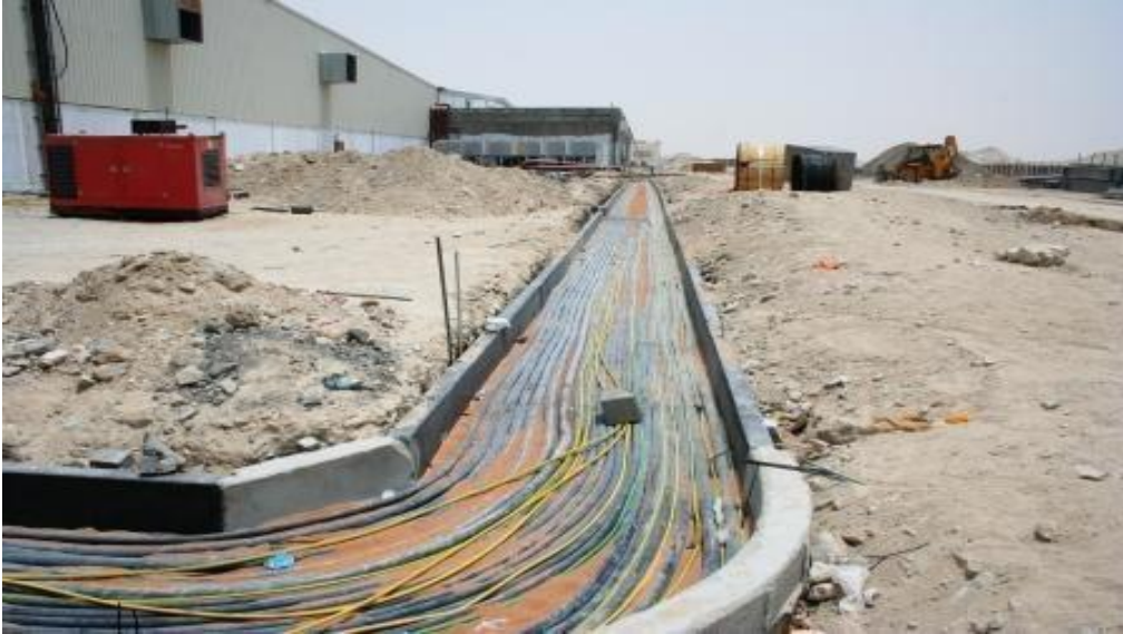
ELECTRICAL WORKS, STRUCTURED CABLING & FIRE ALARM